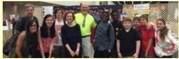
ECT Youth at Detroit Gathering