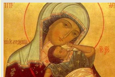
Mary Mother of Our Lord, August 15

Go to our website here for more pictures.